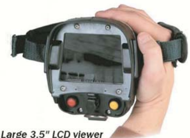
Large 3.5" LCD viewer

Barak Systems is happy to introduce the HeatFind IR Series from Monroe Infrared. For more than 20 years building weatherization professionals, home and building inspectors have trusted MITi to provide them with quality Infrared cameras, training and accessories. We are proud to be their local distributor!